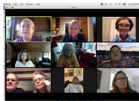
Our Sister Parish Committee made plans for the annual Tacos for Madre event during a May Zoom meeting.