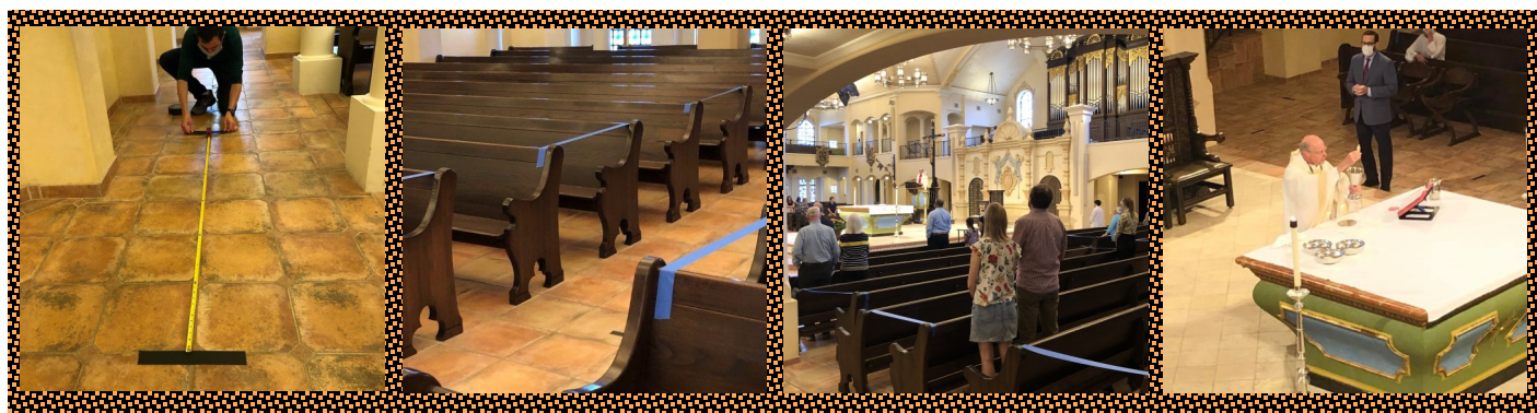
During the pandemic, social distance markings, alternating pews, masks and social distance between households has become the norm at Masses.