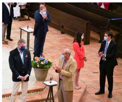
The initiation of our new Catholics was one of many postponements as the normal Easter Vigil sacraments were moved to the vigil of Pentecost.